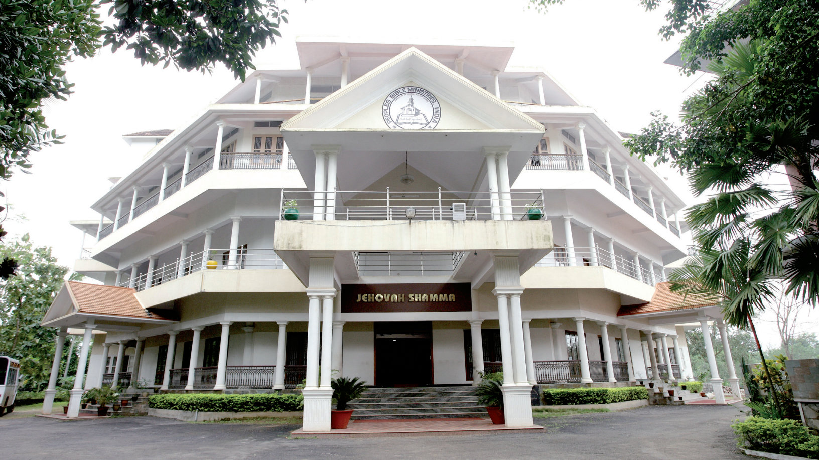
Auditorium and classrooms at Peoples Baptist Bible College and Seminary in Trivandrum, India